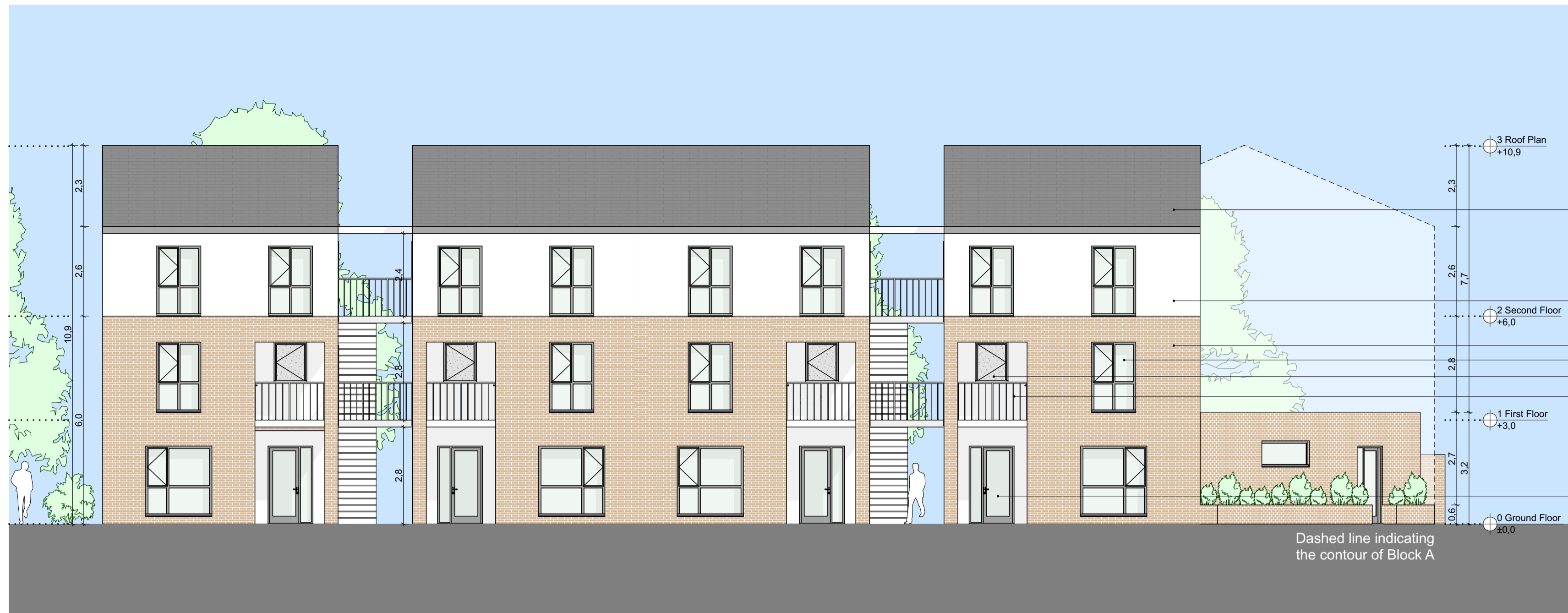
North Elevation 1:100