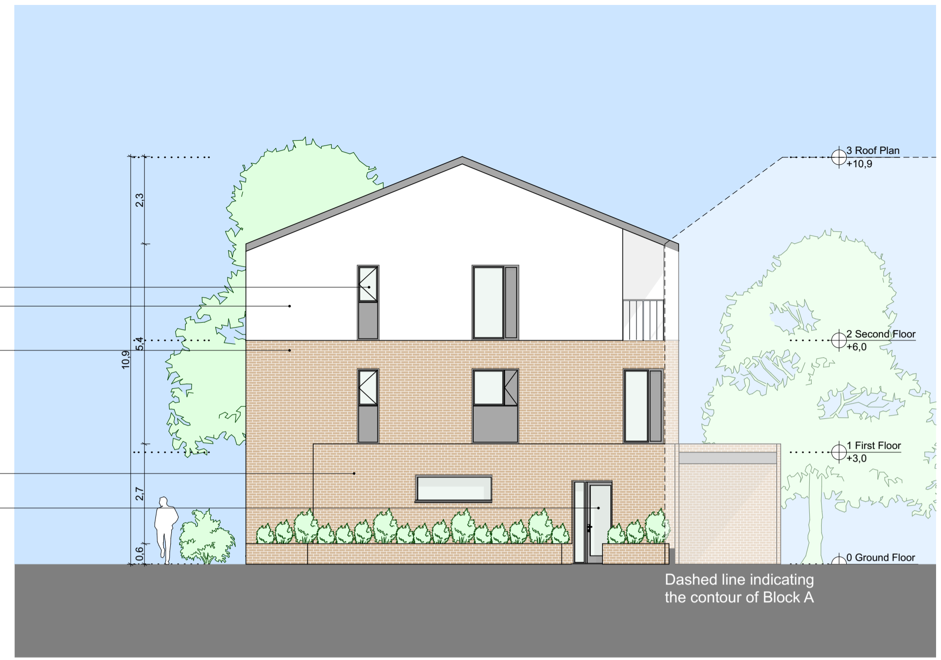
West Elevation 1:100