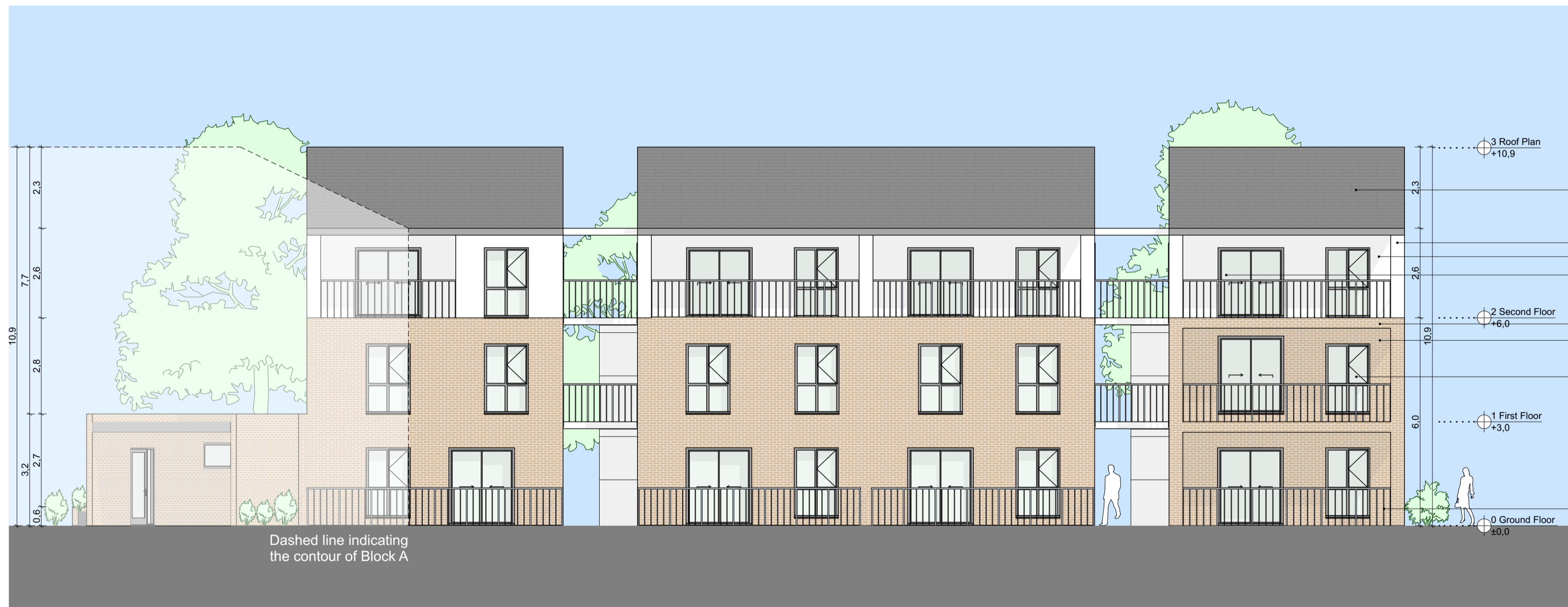
South Elevation 1:100